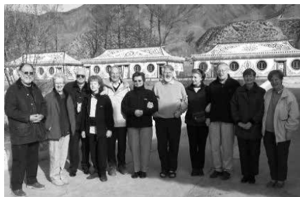
Cantravellers in Labrang, China.