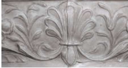
Detail in historic fireplace at NBHS, Canonbury.

Planning permission already exists for the building's use as a non-residential education and training centre, albeit with restrictions.