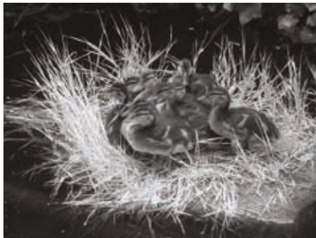
Introducing the first ducklings on our patch of the New River since 2006. By Jack Lambert

At least one drake and two ducks of the 32 mallards on the New River last February got together and produced the first ducklings since 2006. Mum No. 1 hatched 9 eggs in June and Mum No. 2 hatched 8 eggs in July. All 17 ducklings survived to maturity.