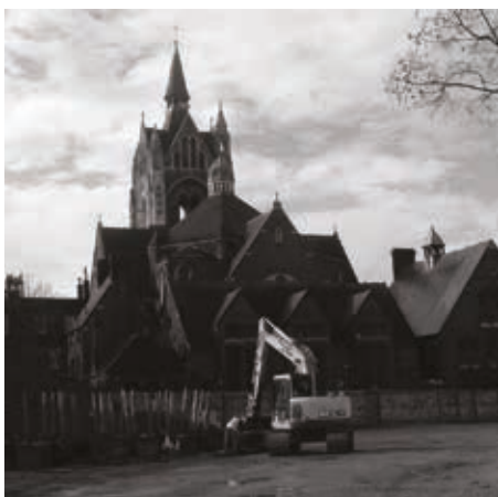
Ground is cleared for construction of a residential scheme at 85 Canonbury Road. By Jack Lambert

height and bulk, and preserve views of Union Chapel tower from Canonbury Road. Although the new design was a slight improvement, we objected again; but the Council granted approval. The old buildings have now been pulled down. For a good view of the Union Chapel from Canonbury Road, go before building work starts.