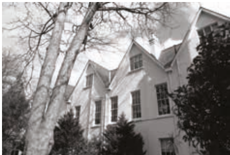
North Bridge House School will open at 6-9 Canonbury Place in September.

The Canonbury Society is pleased that this historic Grade II listed building, which has been empty for some time, will now be occupied. We welcome the school's plans to restore King Edward's Hall, formerly the home of the Tower Theatre, now in disrepair. But we are concerned that occupation by a school of 200-300 pupils could constitute an over-use.