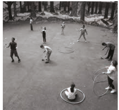
Swinging into action with activities at the Rose Bowl.

Visit our website: http://www.friendsoftherosebowl.org.uk where you will find case studies and our Annual Review 2013. If you would like to get involved or learn more, please email: info@friendsoftherosebowl.org.uk .