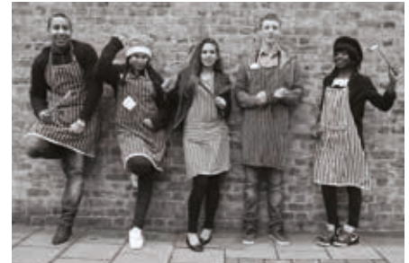
Making healthy meals at Urban Hope.

We blog about what we cook each week on our website: www.urbanhope.co.uk