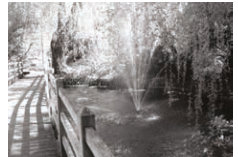
Mini Chatsworth-style fountains now ornament the New River in Canonbury.

The team of volunteers who removed it on Saturday mornings can now focus on clearing the pump intake grille and gathering windfall branches.