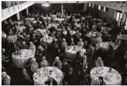
Celebrating Islington Giving Week.

Thanks to generous support from residents and businesses, over 40 local organisations have been supported across the borough through Islington Giving. We have managed to raise over £2.6m for Islington in three years; and over 1,000 volunteers are now involved. Last year we held the first Islington Giving Week which saw over 3,500 people attending 35 events. This will take place again this year from 9–15 June 2014.