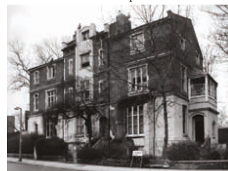
The abandoned terrace of 18, 19 and 20 Canonbury Place in 1975.

and threes, with front and back gardens. 18 Canonbury Place was one of them. Little remains to tell us about the early years of the house, but documents relating to 20 Canonbury Place lead me to believe that all three houses were completed around 1848.